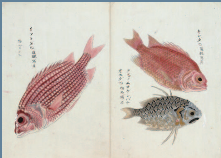
Ebisudai/Matsukasauo/ittoudai from Ito Keisuke collection "Kinka Gyofu" at Nagoya University Library